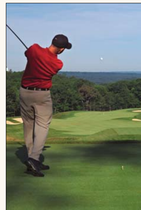
LAKE OF ISLES

We offer 100 guest rooms with 4 distinct suite options. The Inn, built in 1929, includes 49 unique rooms with elegantly refined décor, poster beds, plush bathrobes, and spa amenities. Wireless high-speed internet service is provided in all our Inn guestrooms. Our 51 Villas offer the ultimate in privacy. Each villa features a bedroom, full bath, galley kitchen, private balcony, and a living room with fireplace and sofa bed. Some villa units afford expanded functionality, featuring a queen loft bedroom, second full bath, and full dining area downstairs.