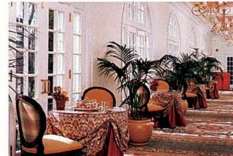
The Palm Court.