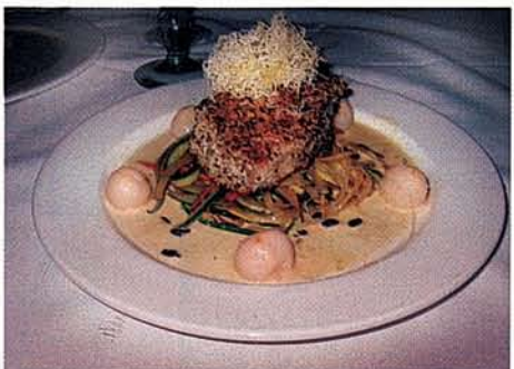
Ahi tuna over bokchoi.

N eed to chase away the winter blues and renew yourself for spring? Then head to The Spa at Norwich Inn , the ideal place to restore and rejuvenate mind, body and soul.