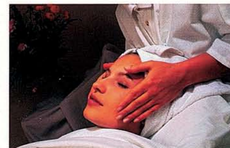
A soothing facial.