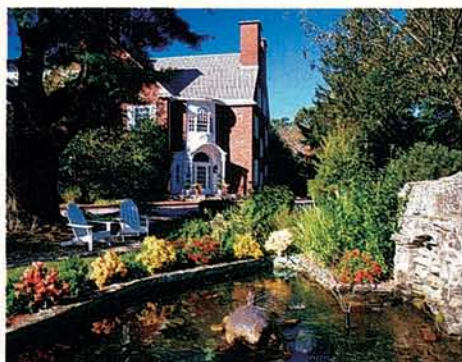
The main building.